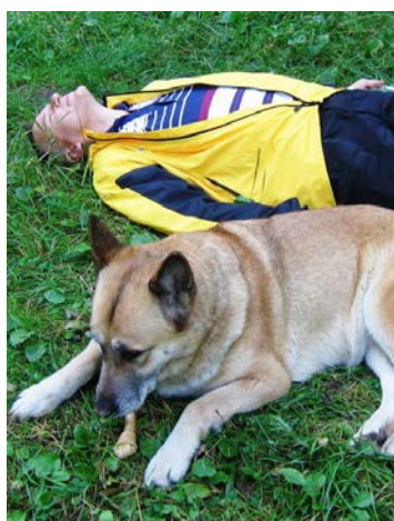
Vytenis Andriukaitis, Commissioner for Health & Food Safety